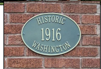
Washington High School 100th Anniversary 1916 - 2016