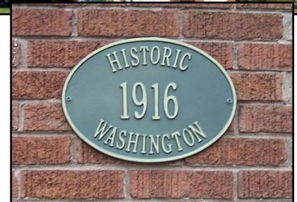
Washington High School 100th Anniversary 1916 - 2016